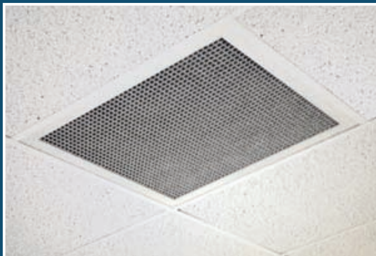
Install in T-Grid ceilings to cover air supply openings, return openings, and fire sprinklers.