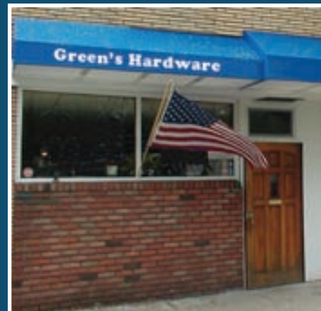
Install under awnings to keep birds from building nests and to shield lighting