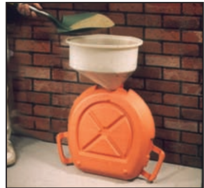
Base can be filled using 50 lb. capacity funnel. The sand is permanently sealed in with a positive lock plug.