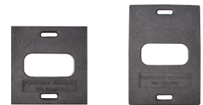
20 lb. base 30 lb. base

Black rubber bases with carrying handles are made from recycled materials.