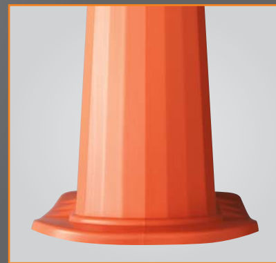
Gemstone sidewall design adds strength & durability